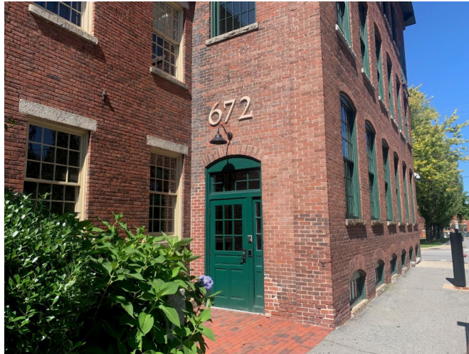
The new home of Northern Middlesex Council of Governments

As of December 1, 2023, NMCOG offices will be at Wannalancit Mills , 672 Suffolk Street, in Lowell. Watch for an invitation to our housewarming celebration in January of 2024!